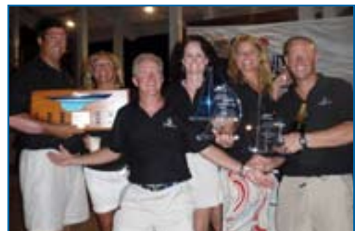
2010 Interliner Regatta Winners